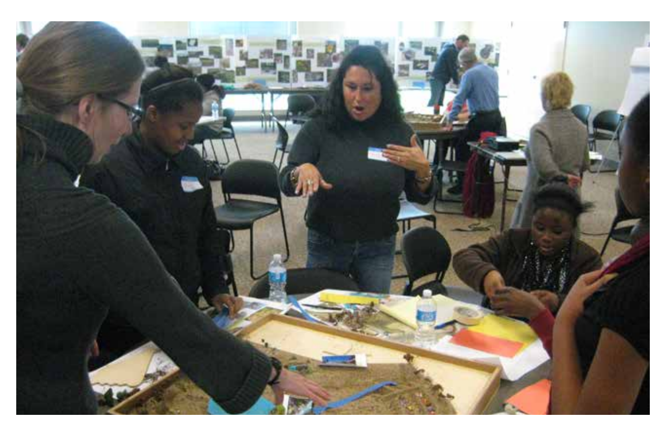
Creative placemaking is the intentional integration of arts, culture, and community-engaged strategies into the process of equitable community planning and development.

This is about more than public murals, festivals, or bistro chairs and string lights. Working in collaboration with local governments, artists and culture-bearers use their talents to engage the community in everything from identifying issues and setting priorities to facilitating processes and developing solutions. The creative perspective manifests in many forms—through artistic mediums such as paint, dance, theater, sculpture, or design, but also through storytelling and language, food, and other types of cultural expression and identity. When intentionally integrated as part of a process—not just an end product—their strategies can facilitate deeper, authentic, and unexpected dialogue, and constructively challenge the way local governments have historically viewed an issue.